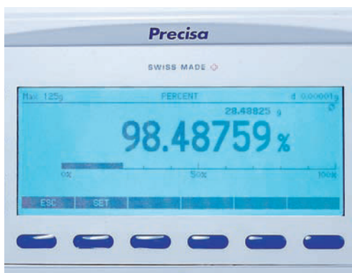
Menu-driven, screen-guided applications