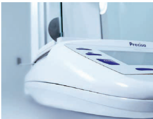
Designed along smooth, flowing lines