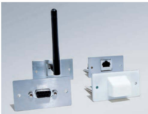
Advanced, versatile connectivity