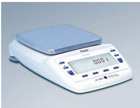
Compactly styled design